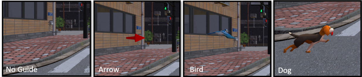
Fig. 1. Illustrations of the attention guidance mechanisms for the 360-degree experiences we compared and evaluated in this paper, from left to right: no guide, arrow, bird, and dog.