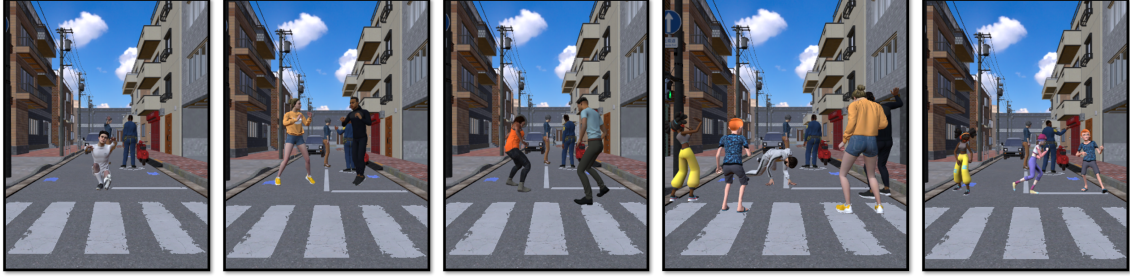
Fig. 4. Screenshots of example target events from each of the five event categories, from left to right: single person exercising, two people exercising, two people dancing, a group of people dancing, kids playing.

take a seat on a rotating chair in the middle of the experimental space, and helped them don the HMD. All of the participants started with a one-minute familiarization session during which they were immersed in the same virtual neighborhood that was used for the experimental conditions. Only the idle characters were present during this session. After confirming that they were ready, we started the first random condition assigned to the participant's ID. The beginning and end of each condition was communicated both with a beep sound heard through the HMD's headphones and was also verbalized by the experimenter. After each condition, we had the participant place the HMD on the chair and then answer several questionnaires on a computer. Participants completed the demographics and familiarity with technology questionnaires last. Afterward, participants took part in a post-study interview followed by monetary compensation.