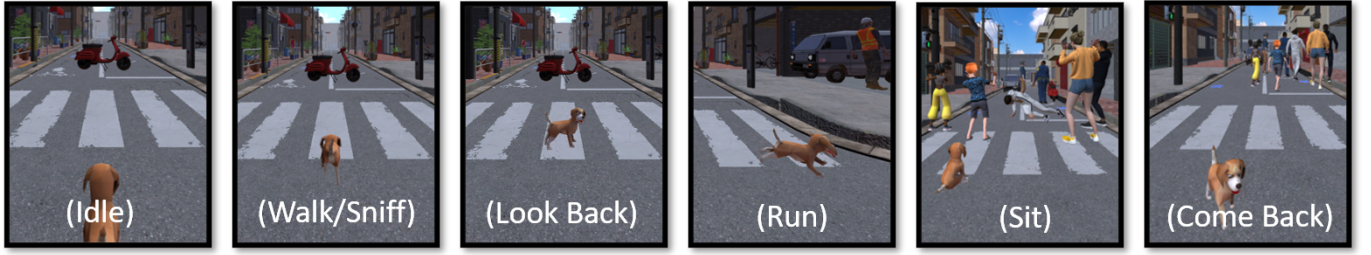
Fig. 3. Screenshots showing the different diegetic behaviors and stages of the acknowledging dog's attention guidance mechanism.