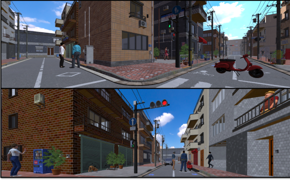
Fig. 2. Screenshots showing examples of some of the idle characters present in the virtual neighborhood.

no-guide condition. Our attention guidance mechanisms illustrated in Figures 1 and 3 were either a virtual arrow, a virtual bird, a virtual dog, or a virtual dog with acknowledging behavior. Each mechanism started its guidance routine 10–12 seconds after the start of the condition or after the end of each event. This guidance routine was repeated five times for each condition.