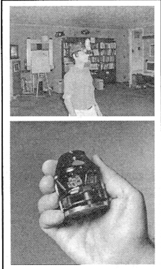
Figure 1. Left: the original UNC optoelectronic ceiling tracker in use, and a close-up of the head-mounted display and sensor fixture, along with the signal processing and communications electronics pack. Right: the new system in use, and a close-up of the self-contained HiBall with lenses and part of the cover removed. See also the color plate Welch 1.

it was unaffected by ferromagnetic and conductive materials in the environment, and the working area of the system was determined solely by the number of ceiling panels. See the left panel in Figure 1, and color plate image Welch 1.